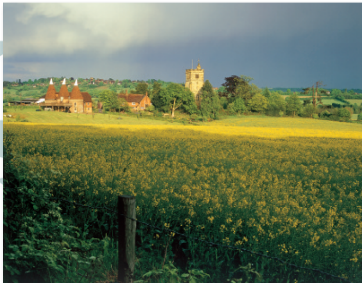
Horsemonden Church rapeseed