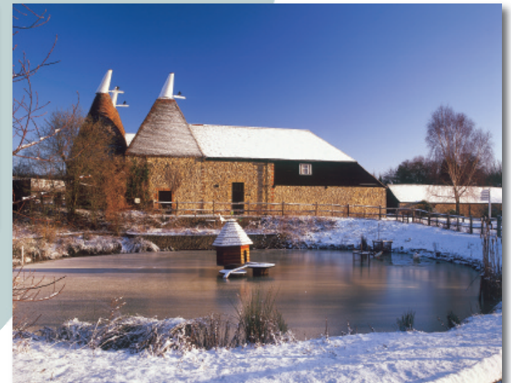
Right: Cobtree Manor Farm, winter. A frozen pond and snow on the roof of the oast-houses at Cobtree Manor Farm on a winter's morning.