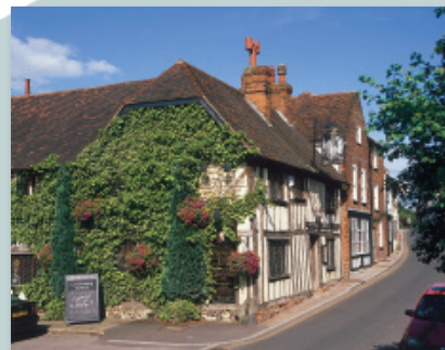
Above: Charles Dickens was a frequent visitor to The Leather Bottle public house in the delightful village of Cobham.