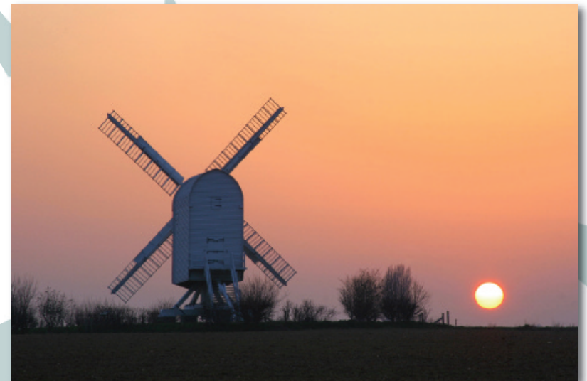
Sunset over Chillenden Windmill.